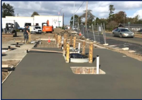
Concrete pad installed after the old tanks were removed and decommissioned.