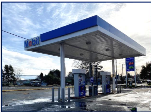
The canopy and fueling dispensers prior to cleanup and construction.

The PPA tested for contamination and developed cost estimates for replacement tanks and infrastructure. Testing results show that soil was not polluted from the fueling activities. Groundwater at the property was discovered to be contaminated with petroleum.