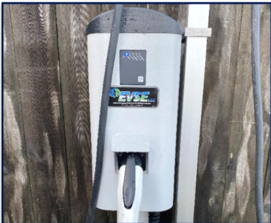
New electric vehicle charging station installed.

The groundwater pollution was addressed by in situ bioremediation. Nutrients are added to the water which stimulates microbes to breakdown the pollution. The pollution level in the ground water is currently being monitored.