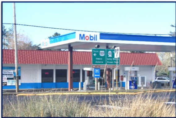
Cleanup and construction is complete.