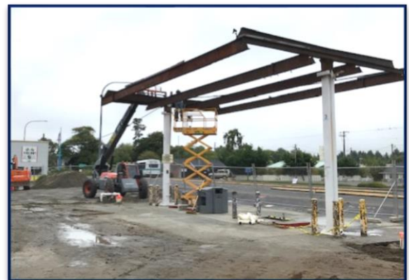
Cleanup and construction included removal of the canopy and dispensers to access tanks.

In 2017, PLIA awarded Seaview Mobil a grant to conduct a Preliminary Planning Assessment (PPA) at the property.