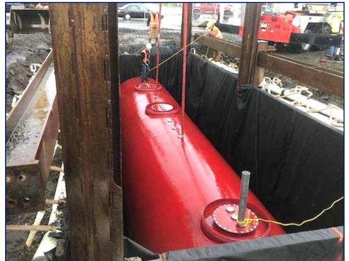
Installation of new multi-chambered UST.

Pollution Liability Insurance Agency P.O. Box 40930 Olympia, WA 98504-0930 (360) 407 -0520 www.plia.wa.gov pliamail@plia.wa.gov