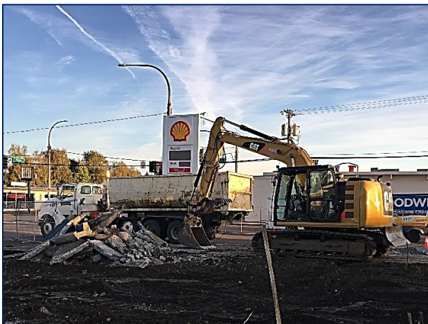
Removing concrete above USTs.

In 2017, PLIA awarded Quick Stop#4 a grant of up to $150,000 to conduct a Preliminary Planning Assessment (PPA). The PPA tests for contamination and prepares cost estimates for infrastructure. No environmental testing had been performed on the property prior to the PPA. The PPA revealed that the USTs had leaked gasoline and diesel into soil and groundwater.