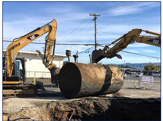
Removed diesel tank.

The Pollution Liability Insurance Agency (PLIA) provides an effective and efficient government funding model that helps owners and operators meet financial responsibility and environmental cleanup requirements for underground storage tanks.