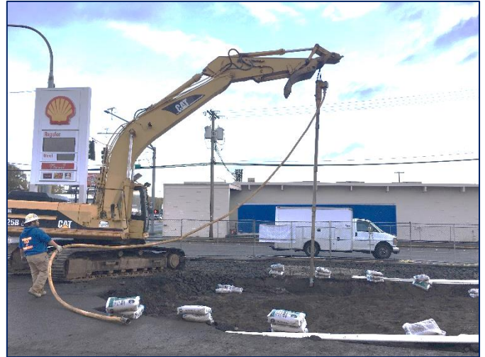
Installation of wells for groundwater extraction.